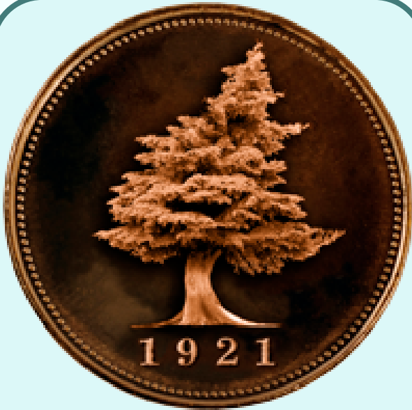
Big Cedar Lodge, USA