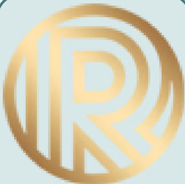
The Residency Group